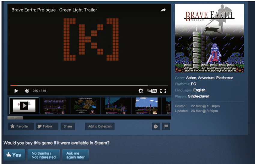
Figure 2: Greenlight example taken from Steam, March 28, 2016.

players (the voting public) to vote “up” or “down” for new releases to be accepted onto Steam. 22