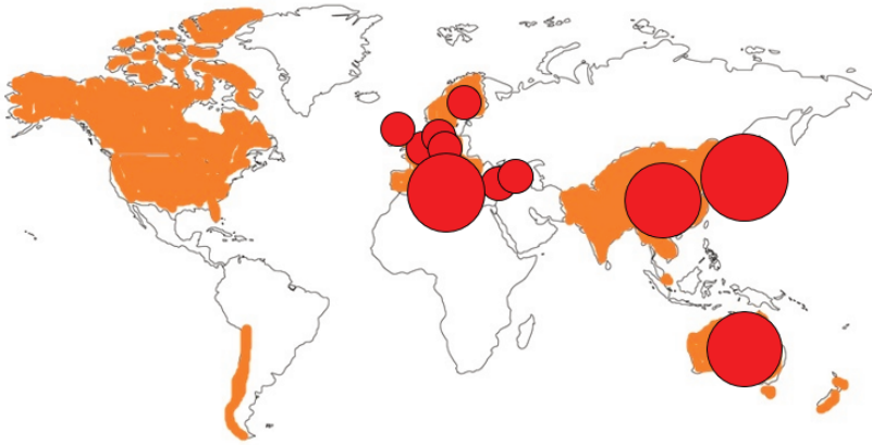
Figure 1: DiGRA chapters (red) and the countries of origin of DiGRA 2017 conference participants (orange) mapped.

However, establishing a chapter of an international, European and North American centered organization outside of these regions brings with it an existing history of doing, seeing and understanding things, or in this case, games. In building networks and supporting local research, Chinese DiGRA has aimed at being particularly sensitive in providing a platform that does not advocate a specific hegemonic Western canon of game studies. However, many of the founding members and members of the current Chinese DiGRA have been educated in Europe. Furthermore, English has been one of the languages used at the conferences, given the diverse backgrounds of delegates and the lack of a single shared language (and the political sensitivity of selecting only one among the few available). Early attempts at dividing conference papers into a Chinese language track and an English language track almost completely negated the original interest behind the chapter as an entity that brings scholars together. Yet simultaneous interpretation at conferences and other events is a significant cost consideration for small, regional organizations.