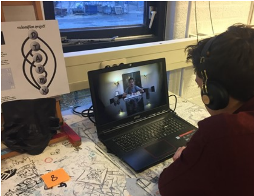
Figure 4: Interactive movie experience realized with PowerPoint

prototype of the mask revealed too many design challenges, and the team deemed the project to be too ambitious. Instead, the advisor to the project suggested the use of simpler technology, and to focus on self-expression and interaction. The resulting project was a powerful interactive narrative of addiction and failure, realized as an artistically filmed interactive movie, using an almost invisible interface with hotspots to trigger different metaphorical video clips that provided a fuller picture of the protagonist's personal narrative (Figure 4). The project showed that a focus on interactive narrative first and technological sophistication second can pay off. Play testers and evaluators were impressed by the project and surprised to learn that Microsoft's PowerPoint presentation software was used as the authoring system.