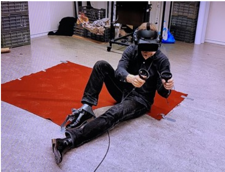
Figure 3: VR experience with right leg fixed to the floor.

experience is that the interactor is an agent tasked with retrieving data from a computer for their remote instructor. However, upon entering the building, an earthquake happens, burying the interactor under debris. To convey this situation, students fixed the interactor's right foot to the ground to create an experience congruent with the player character being physically restricted (Figure 3), thus also limiting the range of interaction. Only after solving a series of puzzles, for instance by combining objects to reach a switch, is the interactor set free. Play testers and evaluators were impressed with the resulting embodied experience. This project showcased how a seemingly simple design choice can have a strong impact on the user experience.