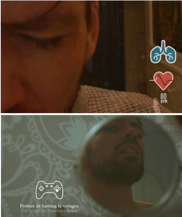
Figure 5: Project Antidotum – Interactive movie